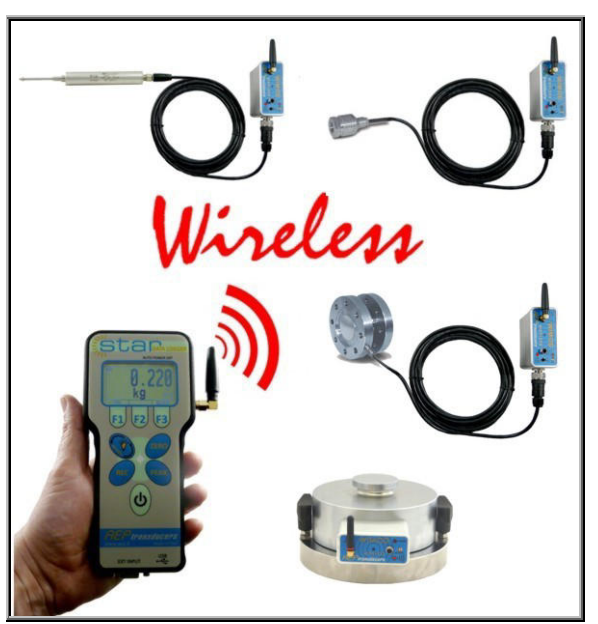
Monitoring of different sensors for example: LDT for displacement measurements TP1 for pressure measurements TRX for torque measurements. C2S for force or weight measurements.