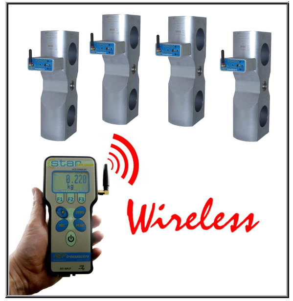
Overhung loads monitoring by using T20, D200 etc. .. dynamometers or load cells

It is possible to simultaneously connect to the WiSTAR (through a Wireless connection) n° 1, 2, 3 or 4 WIMOD modules directly connected to the load cells or in the stand-alone mode.