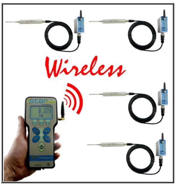
Displacements Monitoring by using LDT transducers.