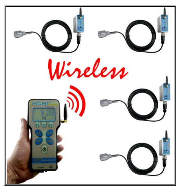
Monitoring of pressures by using con TP1 and TP16 pressure transducers.